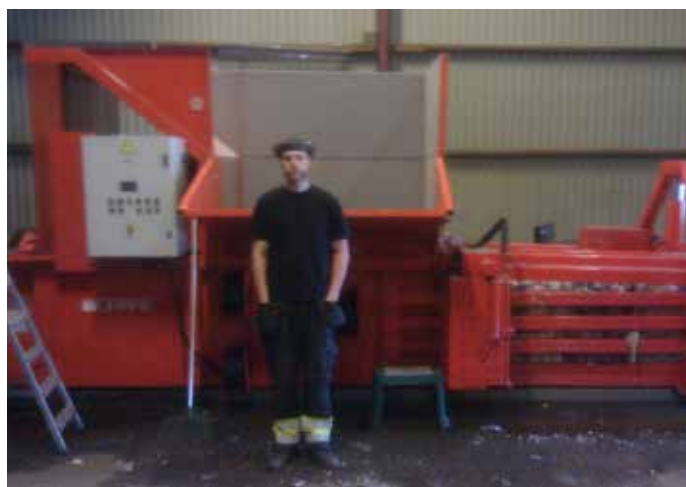
Investing in the automatic horizontal baler was a rational decision.

"I am very pleased with the automatic horizontal baler and the cost-reduction we gain by it."