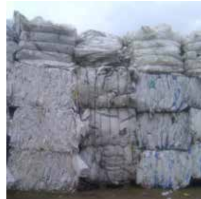
Neat high-density plastic bales

International Cargo-Line Sweden AB is a family-owned business started in 1988. "We recycle any type of plastic" is the business concept and Cargo-Line focuses mainly on large manufacturing industries and municipalities. The services include recycling, trade and transport of plastic and approximately 50 % of the material is exported.