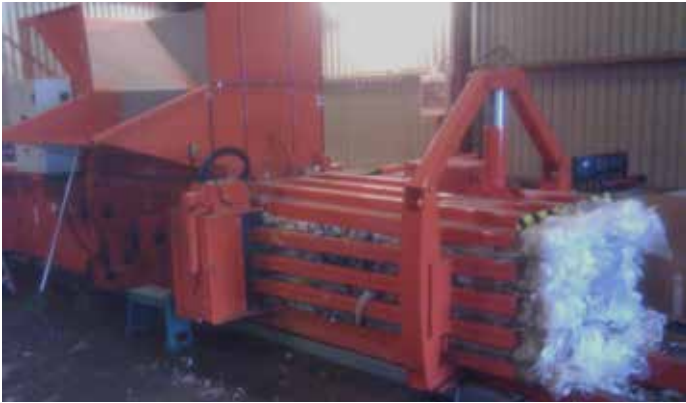
A constant flow of plastic bales